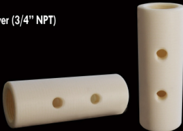
WCM5268-Hydex Chemical Injection Tower (3/4" NPT) $39.00 ea.

Chemical Injection Tower with 3/4" NPT ends and 1/8" NPT crossholes. Hydex Plastic.